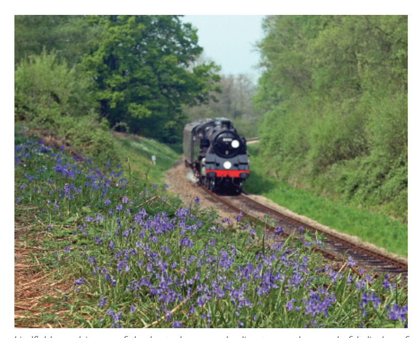
Lindfield wood is one of the best places on the line to see the wonderful display of spring flowers.