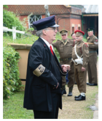
The station staff are doubling up as Home Guard, at least for the duration of a Southern at War weekend.