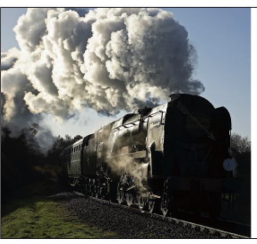
A book ensures's entiting with a great light of on the side of No. 5000, homeou, in study No. H420s, Addresses, the dispate. The glow phonograph, where the light consens also been distance must be with of the bottom bios. In the first paid is rather phonograph; where the light consens also been at last in the current angle. Opposite their age out the count of bottom of Kernes of the dark is done at local or at local or at local Curing, with the early meaning light conting a point either.