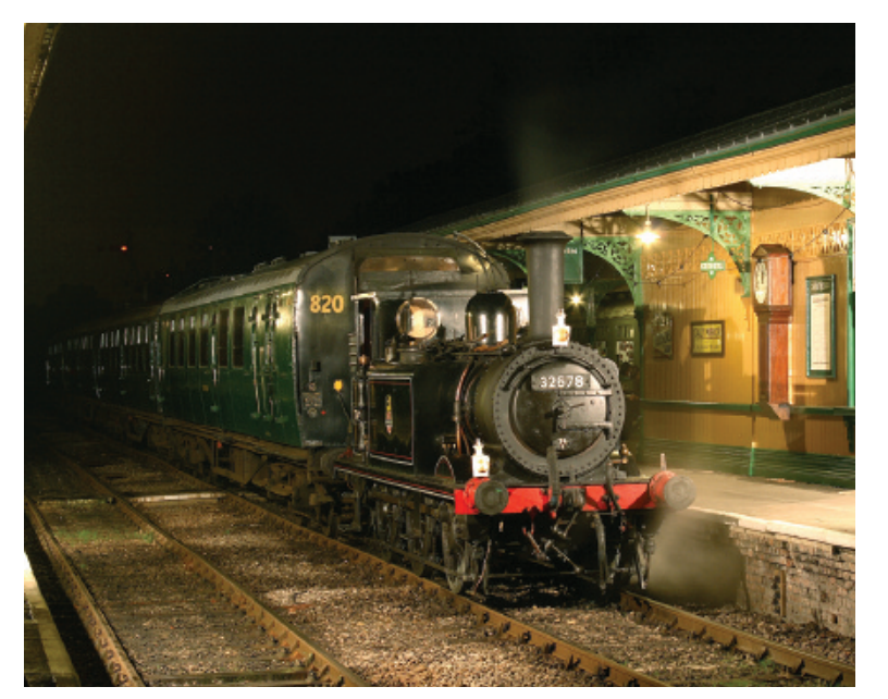
A one-off special event held at the Railway was a Terrier Gala. No. 32678 was a visitor from the Kent and East Sussex Railway for this special weekend and is seen here complete with some Bulleid coaching stock.