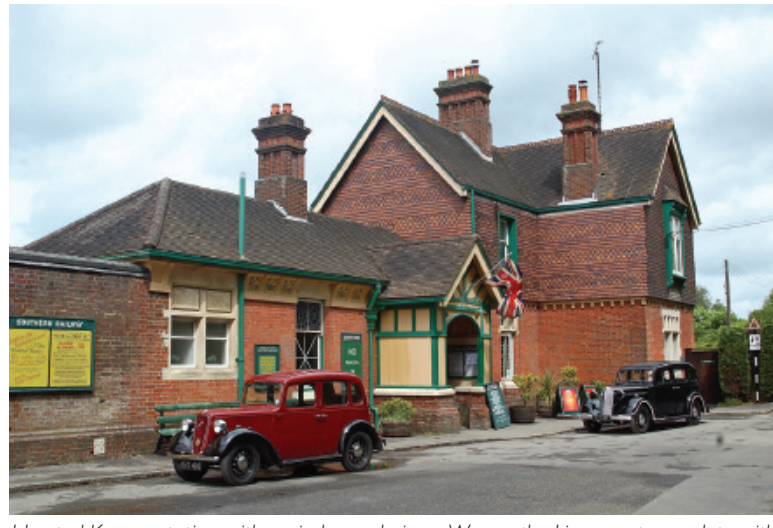
Horsted Keynes station, with period cars during a War on the Line event, complete with masking tape on the windows.